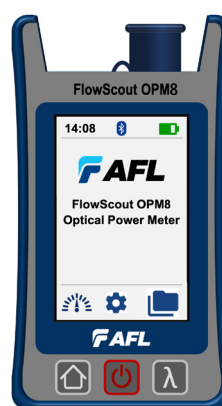
Test Results Saved in OPM8 Internal Memory