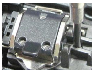
How to set

Note: CLAMP-S70 series is supplied as a pair, for the left and the right respectively.