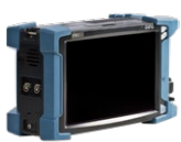
Platform FTB-2/FTB-2 Pro, FTB-4 Pro