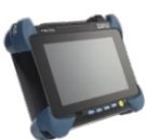
Platform FTB-1v2/ FTB-1 Pro