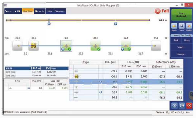
Figure 3: Individual fiber link view

Figure 2: Typical test set-up for an unpinned-to-unpinned MPO trunk