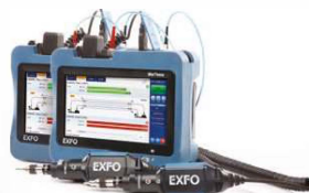
MaxTester 940 Fiber Certifier OLTs