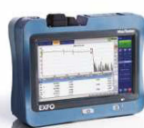
MaxTester 700B QTRD Series