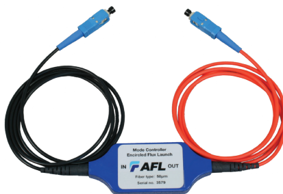
Encircled Flux (EF) Mode Controller

EF Compliant solutions available, see pages 3 - 4 for details