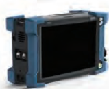
Platform FTB-2 or FTB-2 Pro