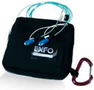
EF launch fiber (SPSB-EF-C30)

Whether for expanding enterprise-class businesses or large-volume data centers, new high-speed data networks built with multimode fibers are running under tighter tolerances than ever before. In the event of failure, intelligent and accurate test tools are needed to quickly find and fix the fault.