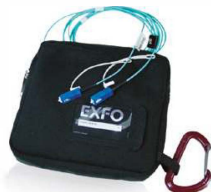
EF launch fiber (SPSB-EF-C30)

Whether for expanding enterprise-class businesses or large-volume data centers, new high-speed data networks built with multimode fibers are running under tighter tolerances than ever before. In the event of failure, intelligent and accurate test tools are needed to quickly find and fix the fault.