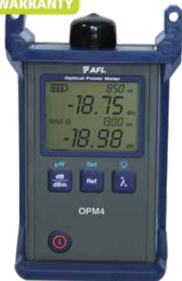
OPM4 Optical Power Meter