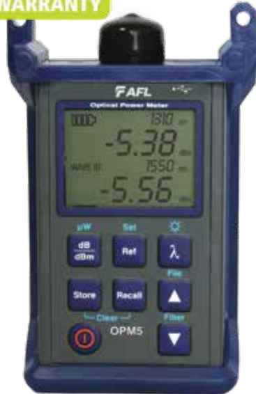
OPM5 Optical Power Meter