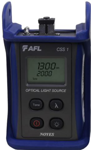
CSS1-MM LED Source

Contractor Series Light Sources and Power Meters are rugged test instruments designed with a simple user interface and backed by an industry-leading 5-year warranty. Both single-mode and multimode kit options provide tools for measuring network insertion loss, continuity checks, and fiber identification.