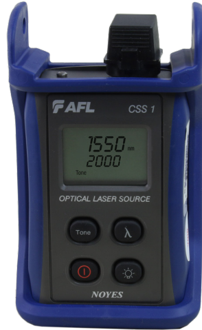
CSS1-SM Laser Source