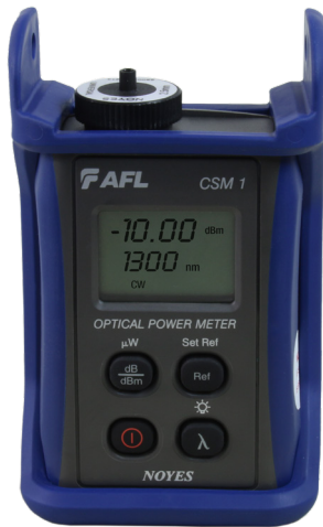
CSM1 Power Meter