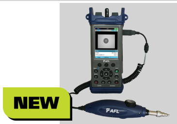
C860 with DFS1 Digital FiberScope