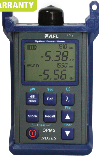
OPM5 Optical Power Meter