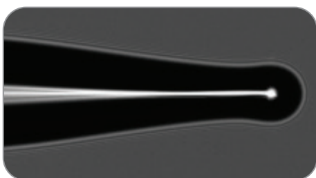
Tapered Probe with Small Ball End