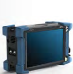
Platform FTB-2/FTB-2 Pro