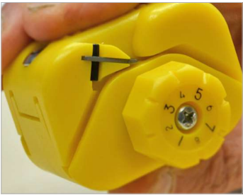
Spring-loaded design eliminates need to lock or clamp tool while in use.