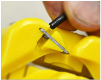
Fixed stainless steel blades require no adjustments and replace easily.

For more information or to locate the nearest authorized Ripley® distributor, please visit www.ripley-tools.com or call 1 (800) 528-8665 to speak to a customer service representative.