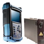
Compact Platform FTB-200