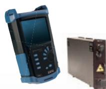
Compact Platform FTB-200