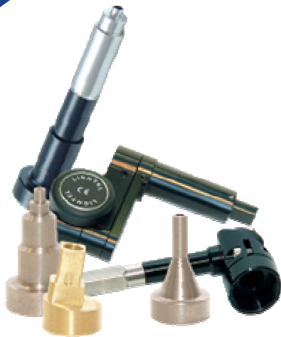
A complete line of specialty tips