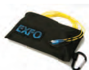
Soft Pulse Suppressor Bag SPSB