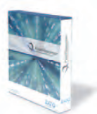
Data Post-Processing Software FastReporter